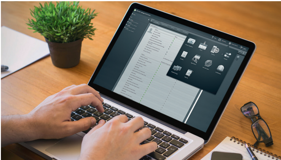
Cortado Corporate Server's Management Console allows IT administrators to manage devices, users and applications as well as all the user rights, policies, profiles, certificates and security settings relevant to accessing the corporate network.

Cortado's enterprise mobility solution is developed and tested at its headquarters in Berlin, Germany. Also experts in offices in the United States, UK, Australia and Japan, highly-qualified consultants at our Berlin location as well as a trained, worldwide network of channel partners provide presence and support to local customers throughout the world.