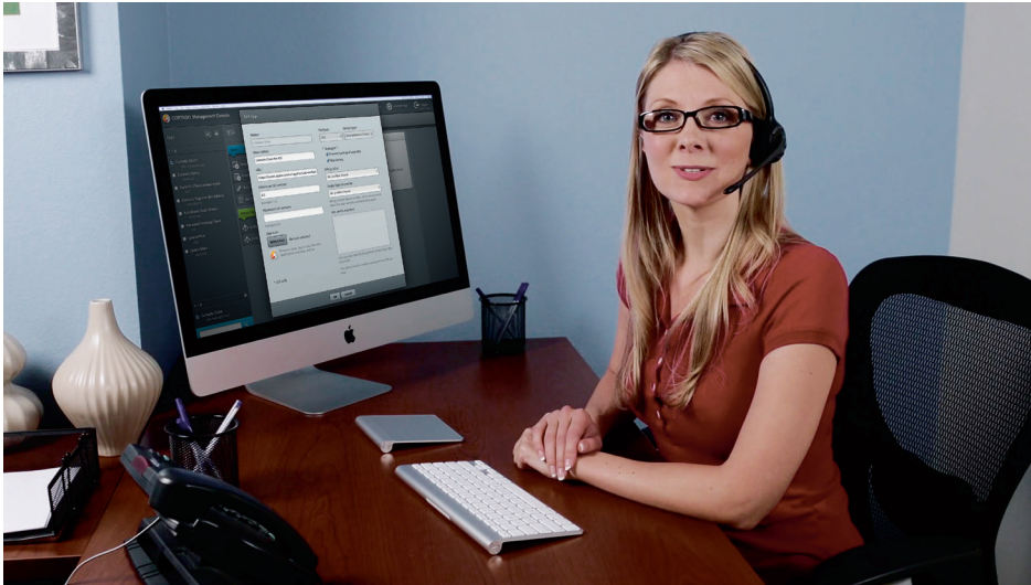
Cortado Corporate Server's Management Console allows IT administrators to manage devices, users and applications as well as all the user rights, policies, profiles, certificates and security settings relevant to accessing the corporate network.

patient files, including doctor's referral letters, diagnoses, X-rays, and lab findings. In Oldenburg Hospital, only apps developed by third parties are used, not in-house developments.